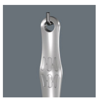
Thanks to its hole the Joker can be neatly hung on the workshop wall.